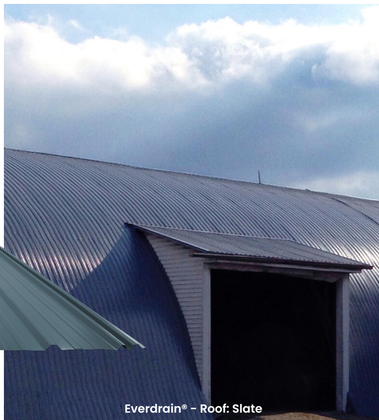
Everdrain® – Roof: Slate